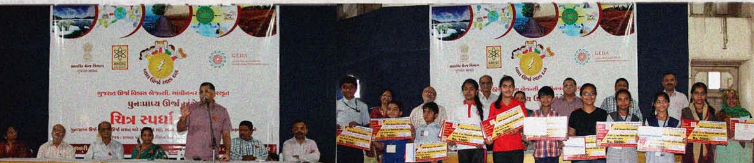
સૌરાષ્ટ્ર સમાચાર, ભાવનગર